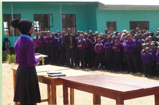
E-Learning demonstration in the Siday Primary School

During our project trip in June, the children in Dongobesh, as well as in Mbulu, proudly showed us their e-learning system. It was great to see that even after 18 months, all the devices were still functional and regularly utilized in the schools. The teachers also used the system to upload their own content and make it available to the children.