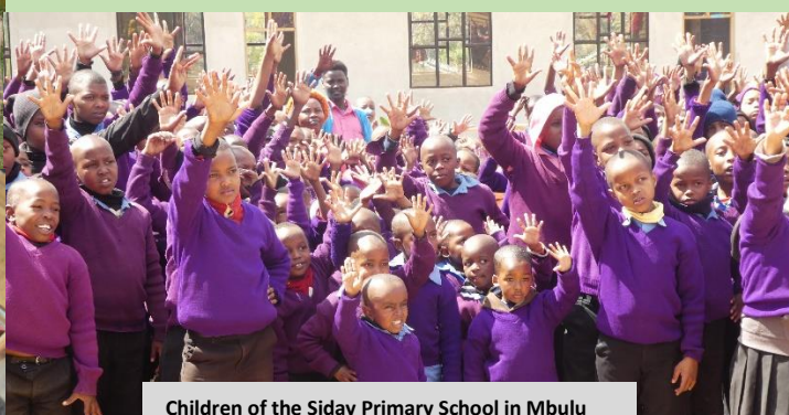
Children of the Siday Primary School in Mbulu