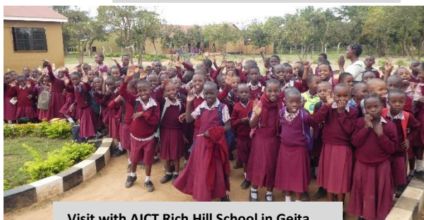
Visit with AICT Rich Hill School in Geita