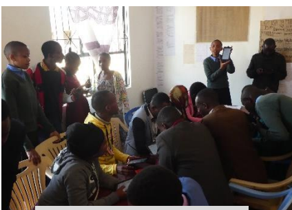
Teacher trainings in the Elite Primary School in Haydom

Another indication of the sustainability of the project was that, during the introduction of the e-learning system at the Elite Primary School in Haydom, most of the training was provided by teachers and students from LEA Dongobesh. Building a "Knowledge Community" in Mbulu District is part of our plan.