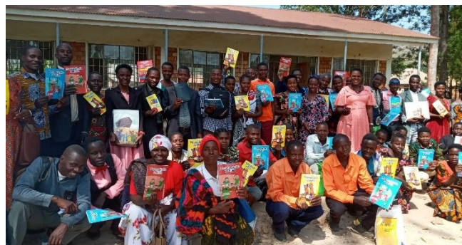
Masomo Bunifu ya Biblia training in Rukoma - in cooperation with World Vision, Allianz-Mission and local training leaders

We are very happy about this partnership! The first fruits of this collaboration were training children's worship workers in our projects in Rukoma and Dongobesh. The program called " Masomo Bunifu ya Biblia " which translates to "creatively sharing Bible stories with children" was used to train over 70 staff members, serving a total of over 1,500 children. We hope that this creative program will be a lifelong inspiration for both staff and children.