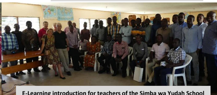
E-Learning introduction for teachers of the Simba wa Yudah School