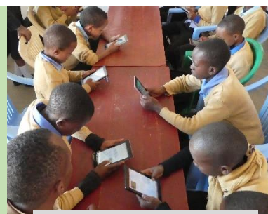
Student trainings in the Elite Primary School in Haydom

Another indication of the sustainability of the project was that, during the introduction of the e-learning system at the Elite Primary School in Haydom, most of the training was provided by teachers and students from LEA Dongobesh. Building a "Knowledge Community" in Mbulu District is part of our plan.