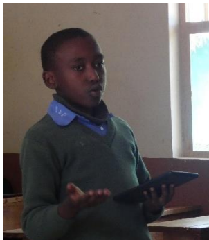
E-Learning demonstration in the LEA Primary School

During our project trip in June, the children in Dongobesh, as well as in Mbulu, proudly showed us their e-learning system. It was great to see that even after 18 months, all the devices were still functional and regularly utilized in the schools. The teachers also used the system to upload their own content and make it available to the children.