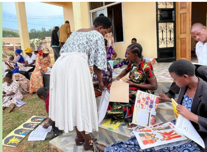
Hands-on training using the Masomo Bunifu materials

The Masomo Bunifu training courses are very praxis-oriented. All theory is immediately put into practice and reflected in small groups, where also personal experiences are exchanged.